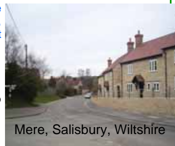
Mere, Salisbury, Wiltshire

This involves identifying sites, and assessing their suitability for housing and liaising with landowners, planners, housing strategy officers, the local community, to bring these sites forward.