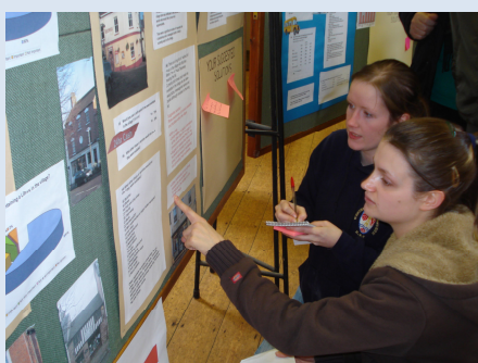
A 3 day feedback event allowed the community to comment on the Parish Plan consultation.

A Parish & Community-Led Plan is inclusive and can demonstrate a robust process that ensures its quality. It is steered by a group of people from within the community, including representation from the parish or town council and follows good practice and advice from a neutral independent body. In Gloucestershire, GRCC is the lead provider of advice and support for parish and community led planning.