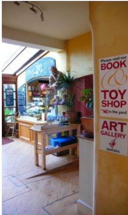
The George Café entrance

Road safety issues are being discussed in partnership with the county highways department. A 17 year old resident's GCSE report on traffic has been added to Parish Plan information